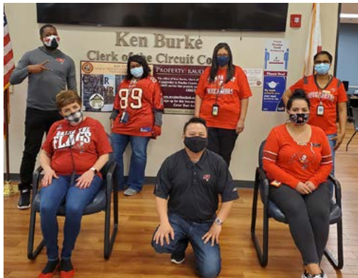
St. Pete Branch, Clerk's Office