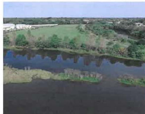
Joe's Creek Greenway Trail Alignment Study