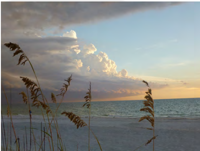
"Moon Set at Sunrise, Indian Rocks Beach", Carla Mogan, Animal Services, intermediate photo