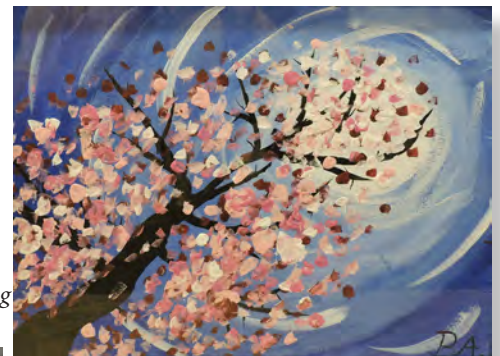
"Japanese Cherry Blossum Tree", Bianca Avlonitis, family member, youth painting