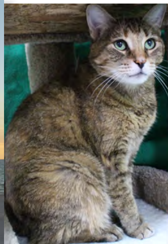
"Waiting to be Found"