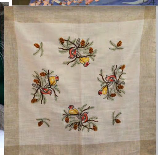
"Birds", Barbara Wood, Heritage Village, intermediate craft