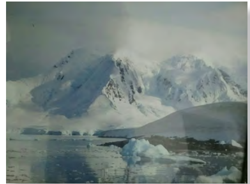
"Antarctic Beauty", Louis Petersen, Brooker Creek Preserve, amateur photo