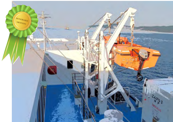
"Ferry to Kobe, Japan", Lynn Bosco, Florida Botanical Gardens, honorable mention, intermediate photo