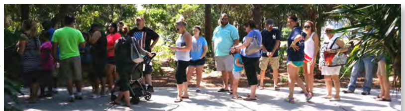
Picture of the line 15 minutes prior to opening.

Thank you for all you do PACK Team Members!