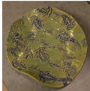
"Old Girlfriends," Cheryl Thurmond, amateur craft