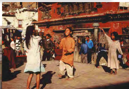
"Kathmandu Kids," Jude Bagatti, intermediate photography

THE NATIONAL ARTS PROGRAM For the encouragement and development of artistic talent