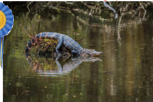
"Alligator Reflections," Gabrielle Harrison, intermediate photography