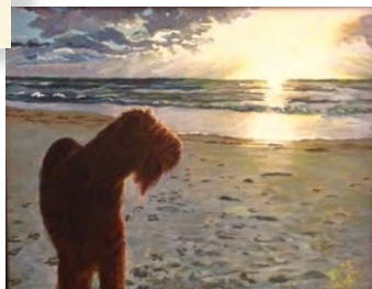
"Airedale Contemplation," Jane Myers, intermediate painting