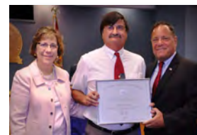
Richard Samay Heritage Village