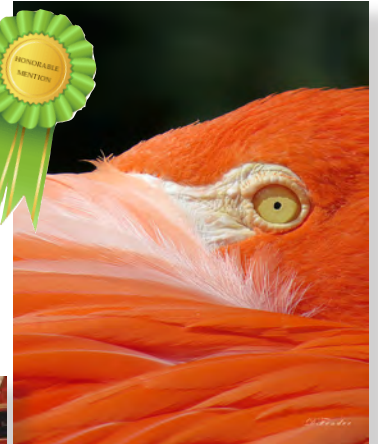
"Peeking Flamingo", Debra Fender, amateur photography