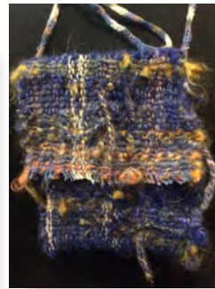
"Hand spun & woven evening shoulder bag," Caroline Tacker, intermediate craft