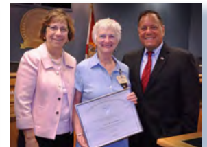
Cathy Blackburn Heritage Village