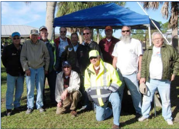
Pinellas County Emergency Management volunteers at the Kiwanis Adventure Run on Honeymoon Island in January, providing safety and welfare communications on the course.

The awards will be presented at the June 3, 2014 Board of County Commissioners meeting.