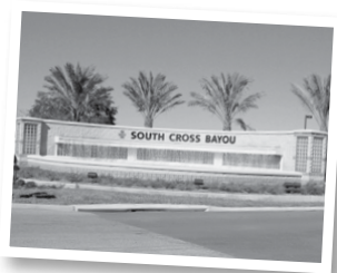
South Cross Bayou Water Reclamation Facility

provides reclaimed water service to residents and businesses in the unincorporated areas north of Curlew Road.