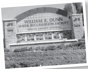
William E. Dunn Water Reclamation Facility

The Pinellas County Department of Environment and Infrastructure owns and operates two advanced wastewater treatment facilities.