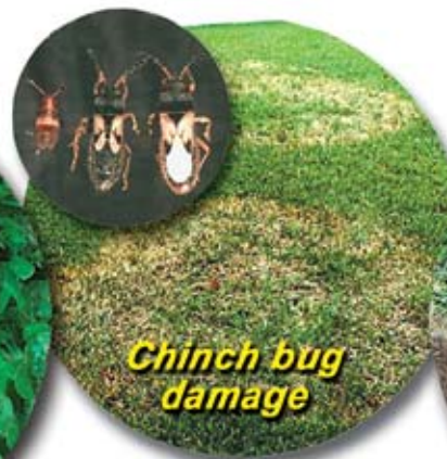
Chinch bug damage