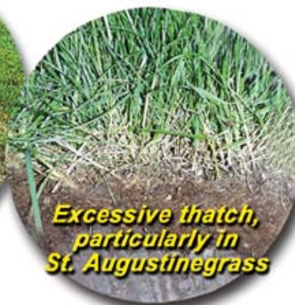
Excessive thatch, particularly in St. Augustinegrass