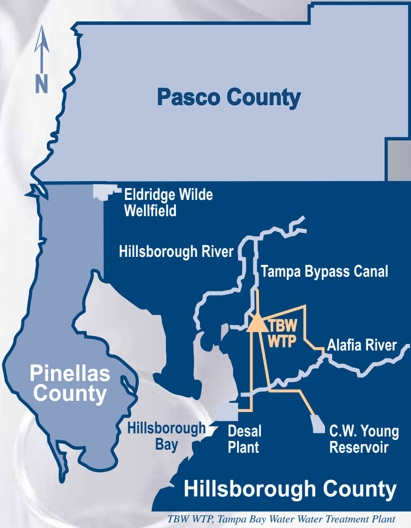
TBW WTP, Tampa Bay Water Water Treatment Plant

The blended water provided by Tampa Bay Water is treated with a polyphosphate inhibitor to control corrosion then fluoridated for dental health purposes. The groundwater acquired from the Eldridge-Wilde Wellfield undergoes water quality enhancements that are comprised of five steps. First, the water goes through a hydrogen sulfide removal process. Hydrogen sulfide is a natural element that has a displeasing odor. A polyphosphate inhibitor is then added to control corrosion in the distribution system and home plumbing. As the inhibitor is added, fluoride is also added for dental health purposes. Next, a chemical disinfectant, chloramines, is added to the water to guard against bacteria. Lastly, the pH (acid-alkali) is adjusted and stabilized using sodium hydroxide.