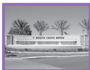
The South Cross Bayou (SCB) Water Reclamation Facility

provides reclaimed water service to residents and businesses in the unincorporated areas north of Curlew Road.