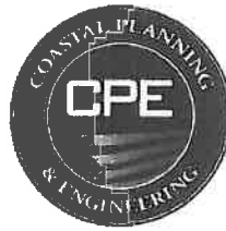
EXHIBIT A Revised March 28, 2013 SCHEDULE OF RATE VALUES FULLY-LOADED (BURDENED) COASTAL PLANNING & ENGINEERING, INC. PINELLAS COUNTY RATE SCHEDULE (April 6, 2013 to April 5, 2018)