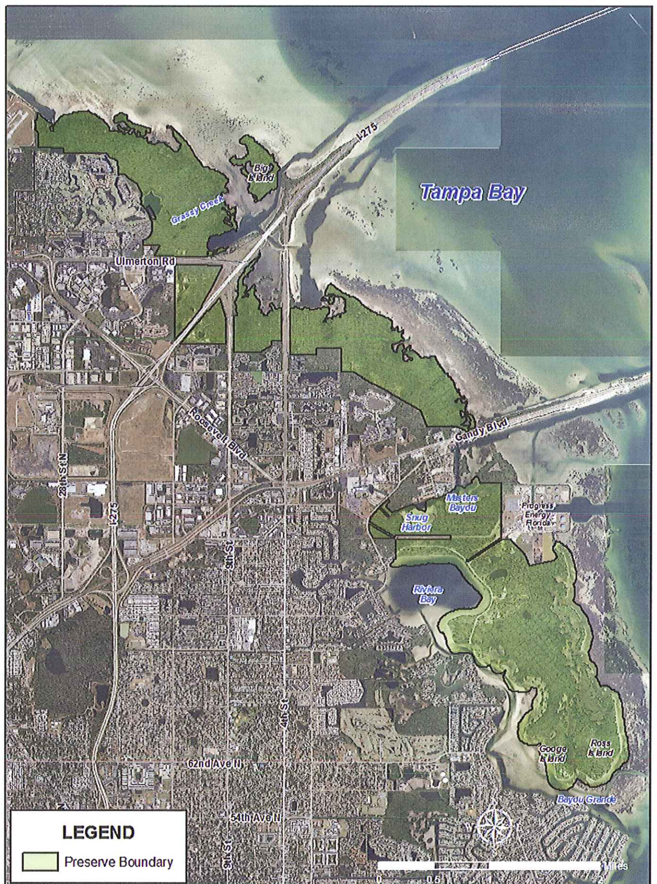
Figure 2. Weedon Island Preserve Boundary Map