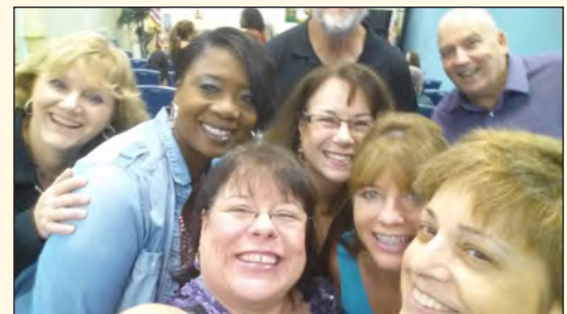
Pinellas Parler club in a "Toastmaster selfie."