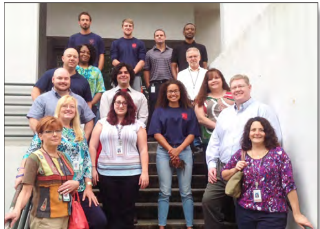
New Employee Orientation class, March 28, 2016.