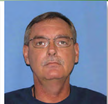
Donald Neumann Airport