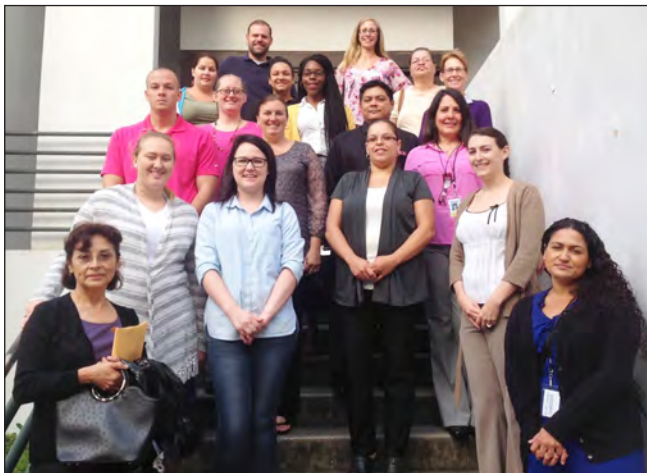
New Employee Orientation class, March 14, 2016.