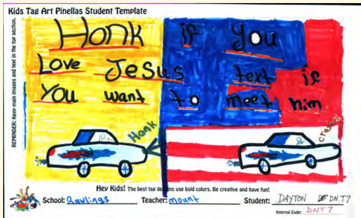
The winning entry.

Read more about the contest and view the artwork available for purchase.