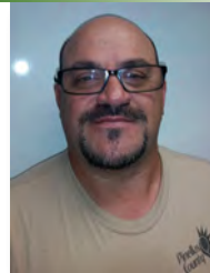
Nicolino Capra Real Estate Management