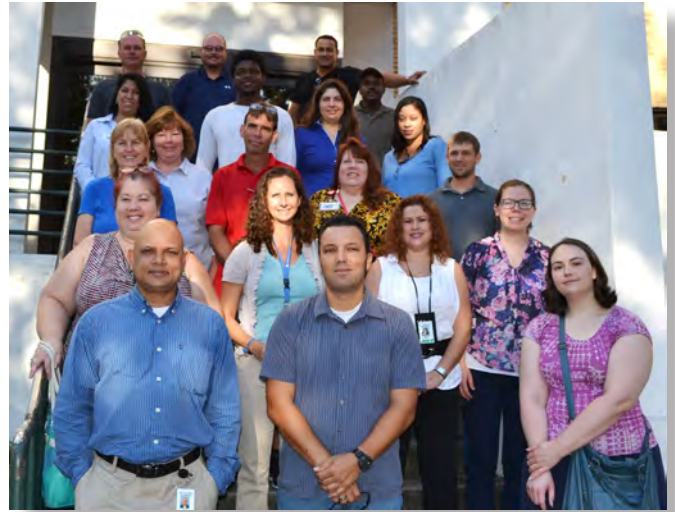
New employee orientation class from September 14.