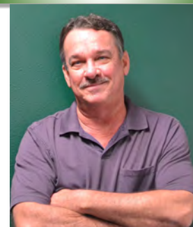
Calvin Morton Scalehouse Services Spec Solid Waste