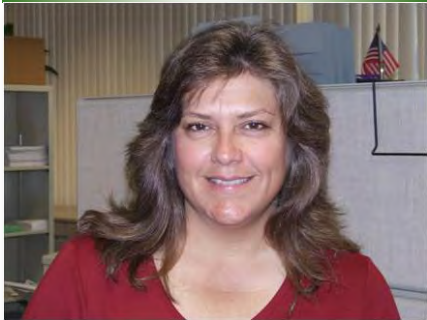
Carol Purchell Building Services