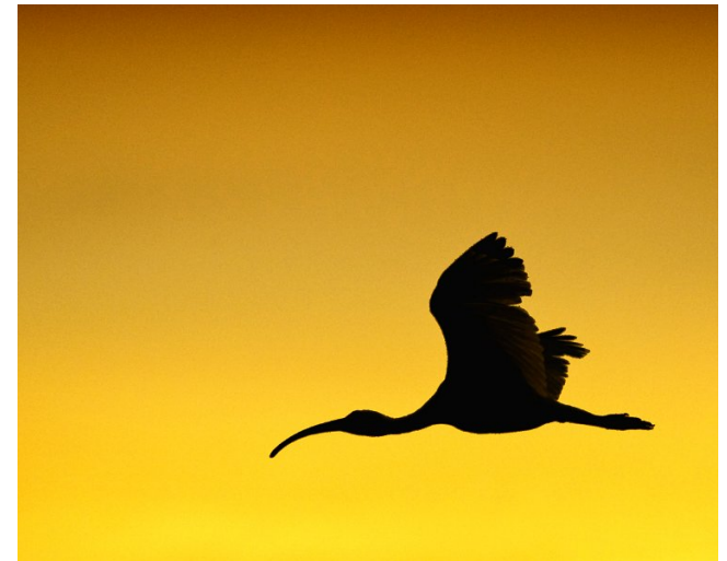
Artwork above: Wilbur Bob Tamboli - Photography

Art Show Image Gallery – http://www.pinellascounty.org/artshowphoto