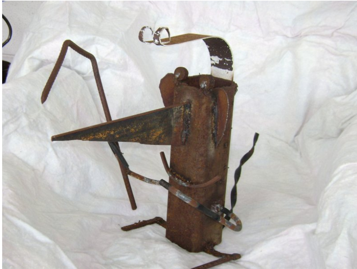
"Elvis The Penguin"