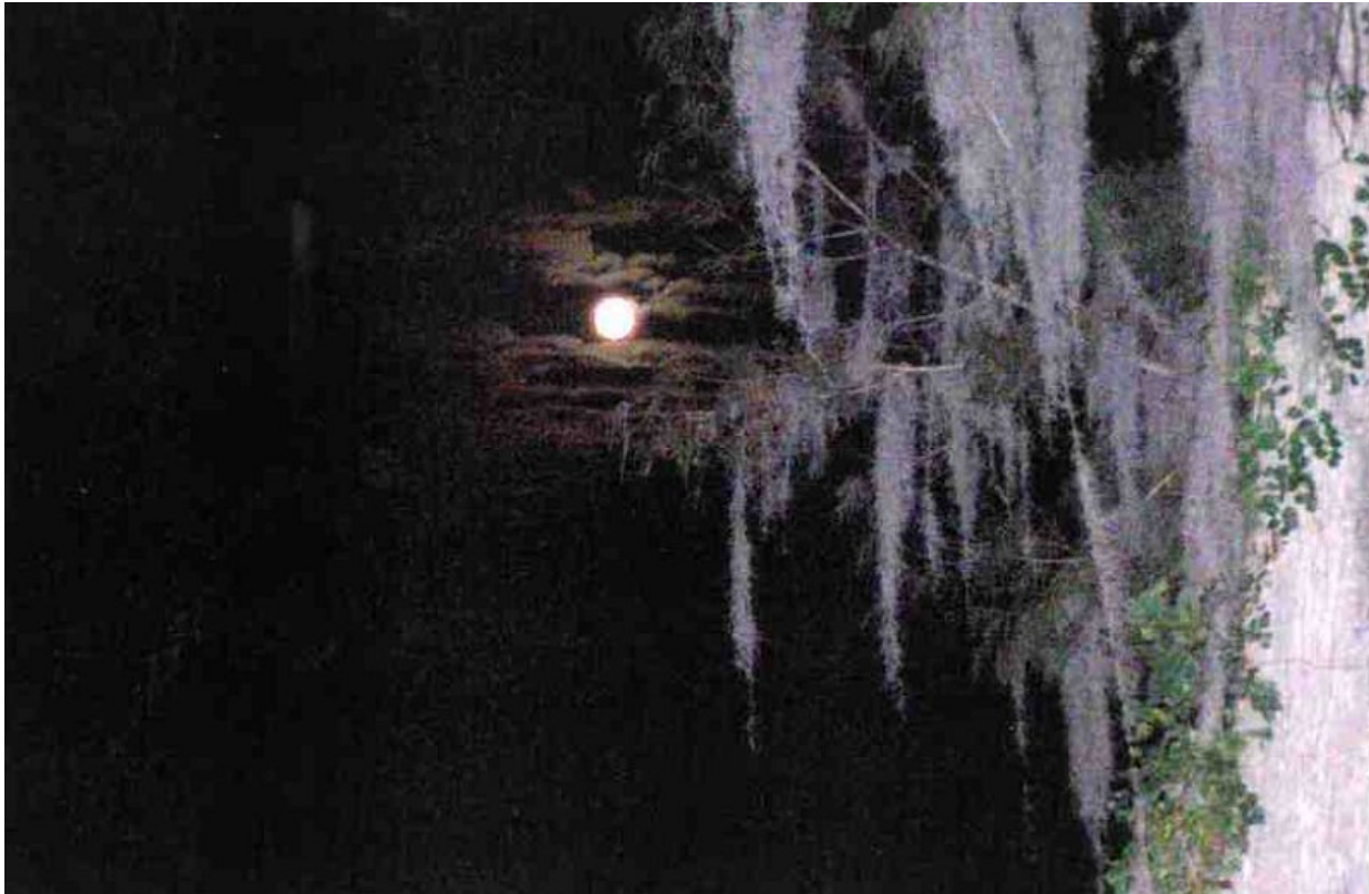
"Bad Moon Rising"