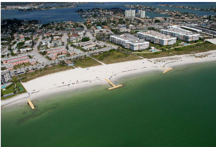
Upham Beach (9-15-10)