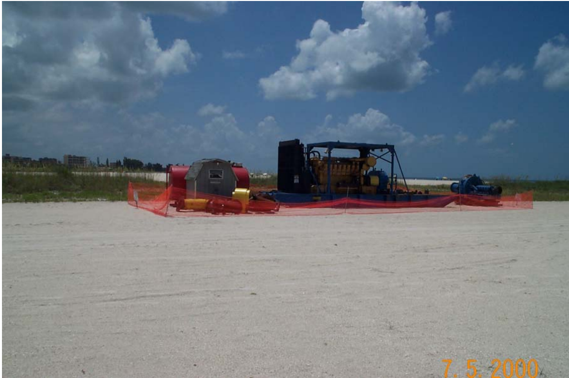
Piping along Sunset Beach at 77 th Avenue, Treasure Island