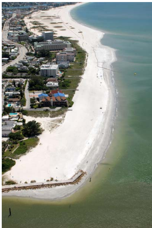
Sunshine Beach N to S (9-1-10)