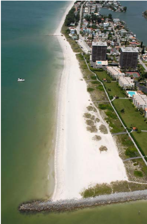
Sunset Beach S to N (9-1-10)