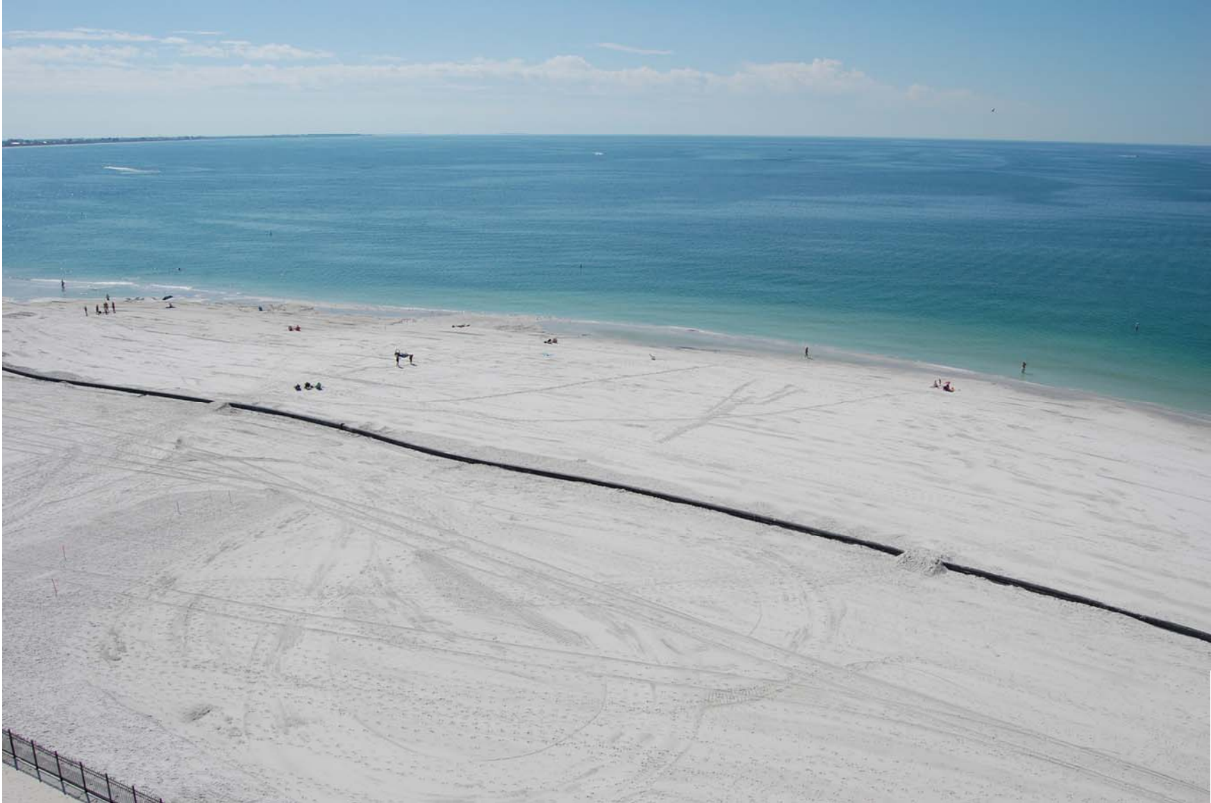
Upham Beach facing southwest (10-20-10)