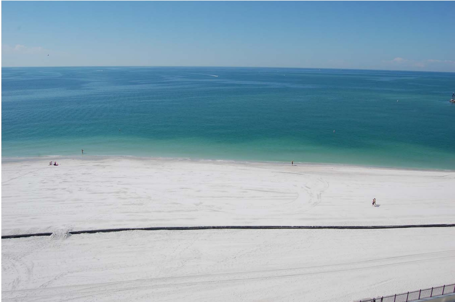
Upham Beach facing west (10-20-10)