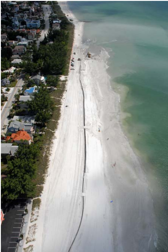
Sunset Beach N to S (9-15-10)