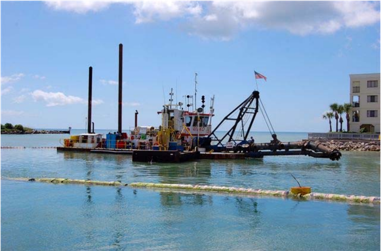
Southwind Construction Corp. Dredge (Wilko) in Blind Pass (9-29-10)