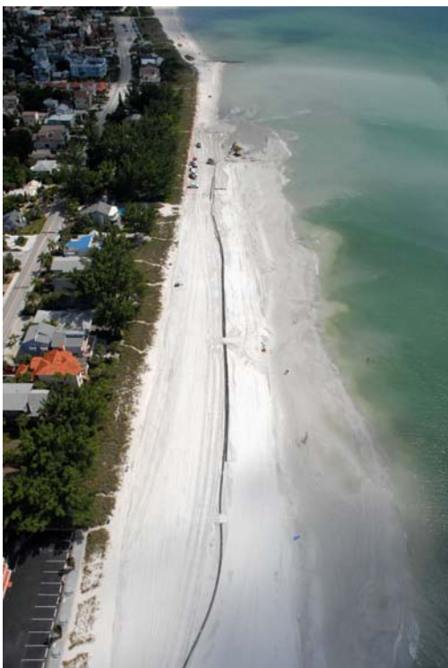
Sunset Beach N to S (9-1-10)