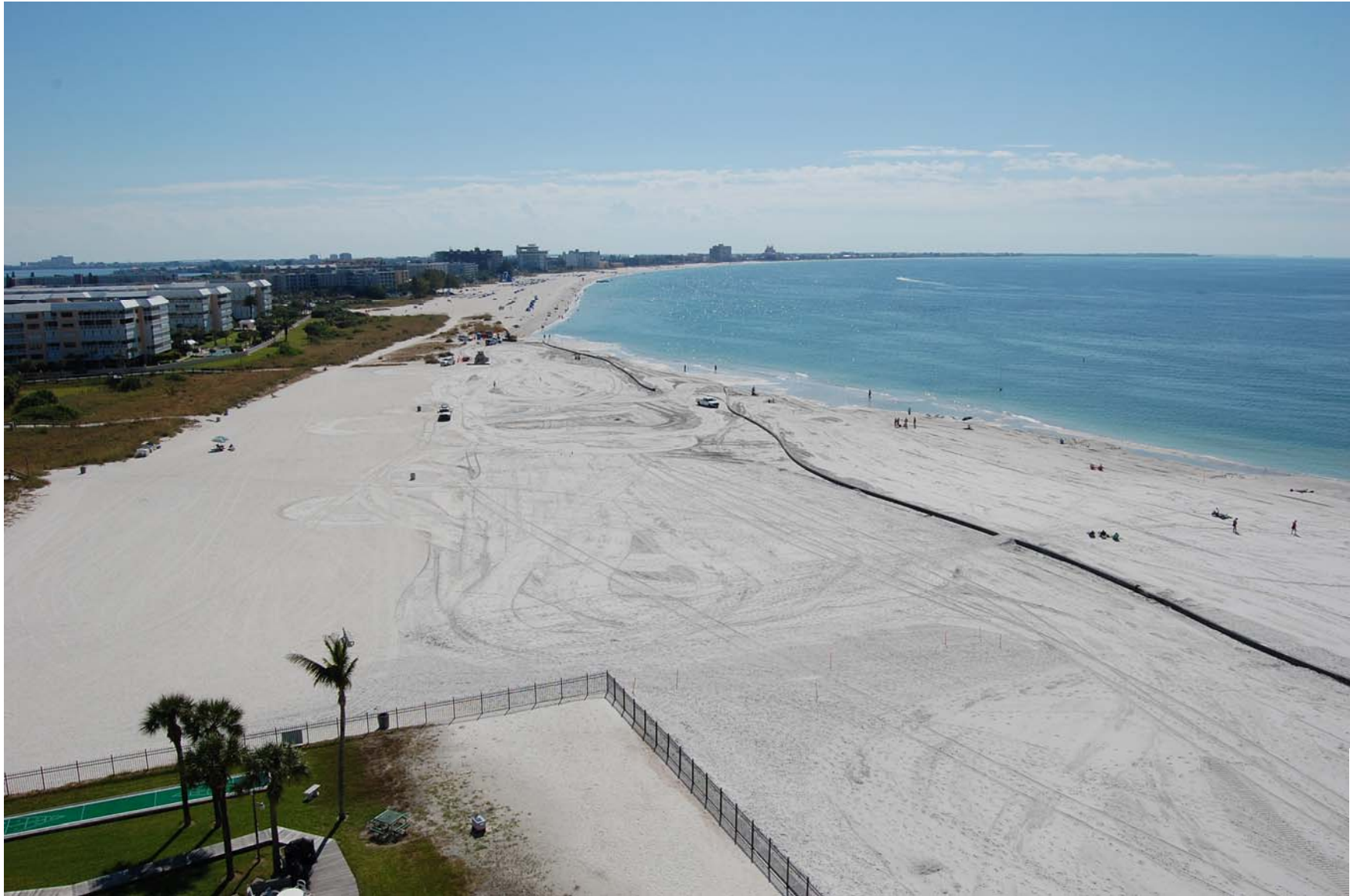
Upham Beach facing south (10-20-10)