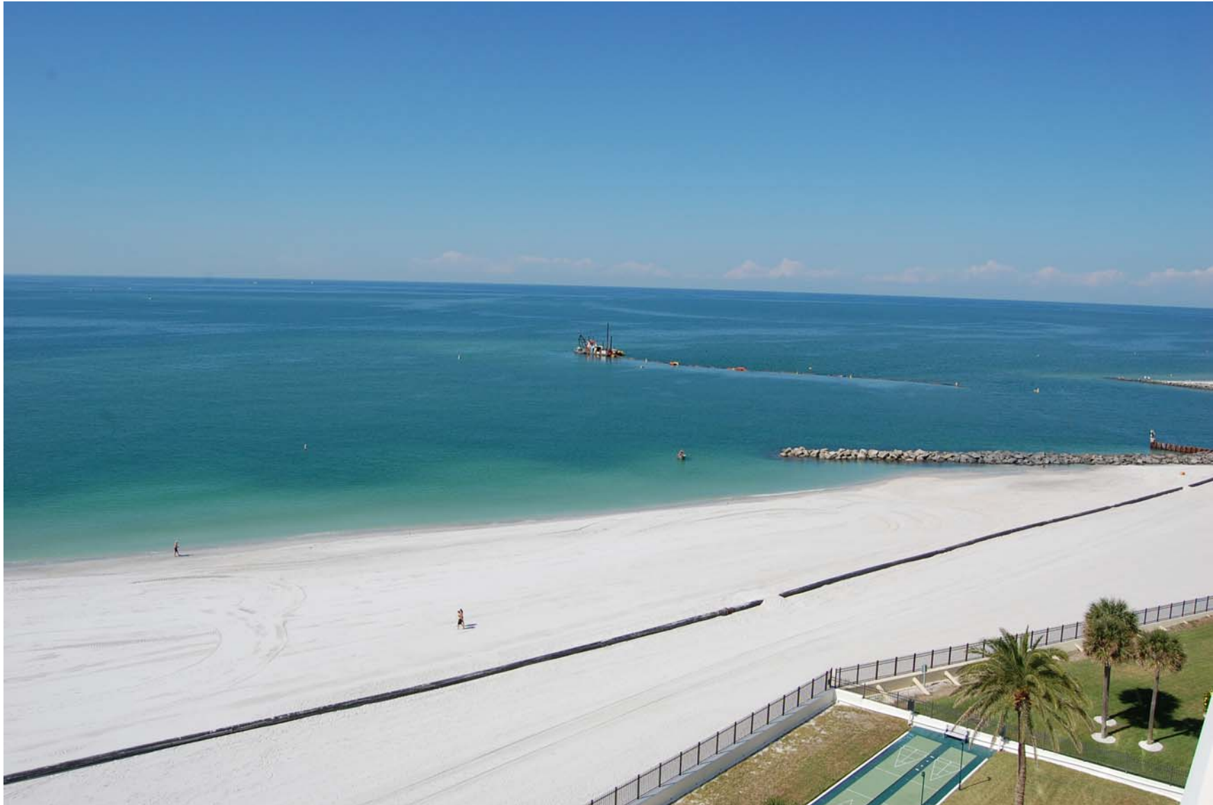
Upham Beach facing northwest (10-20-10)