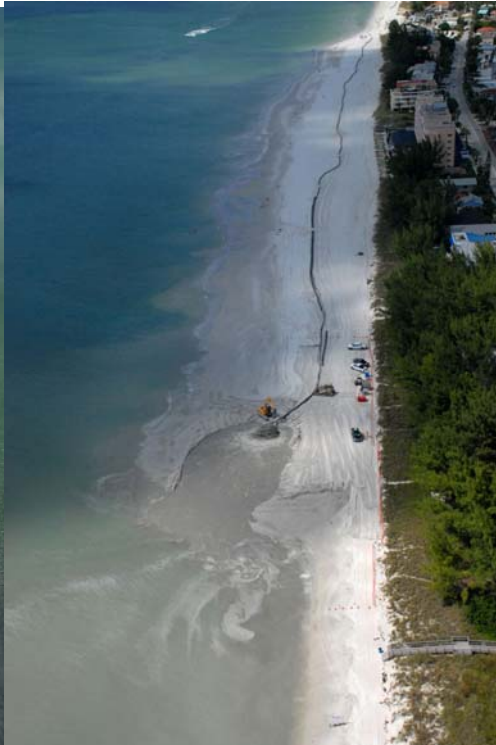
Sunset Beach S to N. (9-1-10)