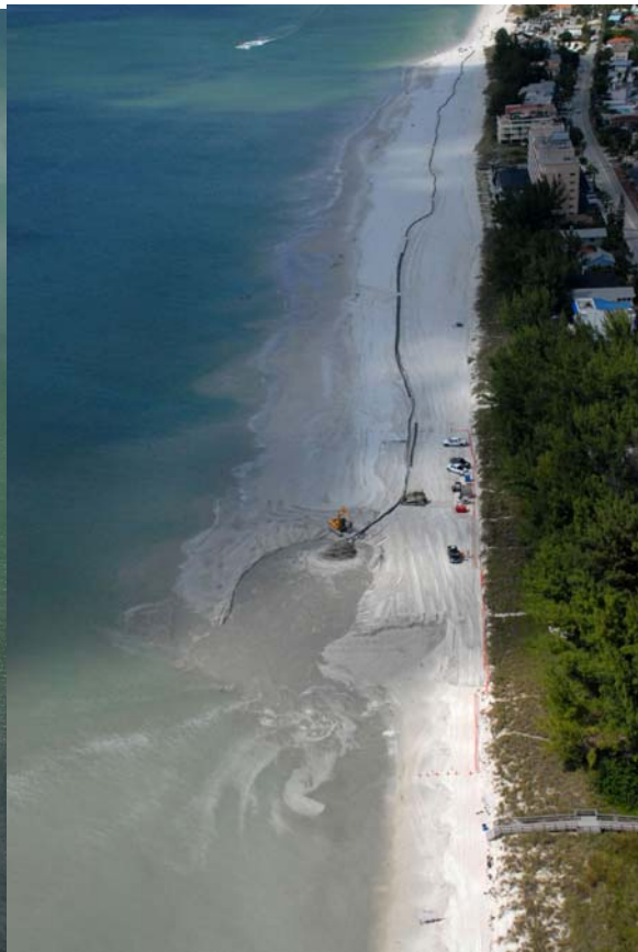
Sunset Beach S to N. (9-15-10)