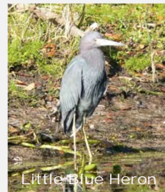
Little Blue Heron