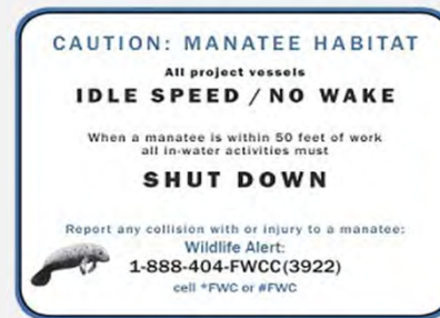
Manatee Caution Sign

This sign is temporarily posted during construction activity.