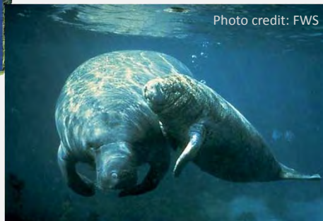
Adult Manatee with Calf

The manatee is listed as Endangered by the US Fish and Wildlife Service (FWS) due to its severe decline in population. This plant eating marine mammal is typically found in freshwater rivers, estuaries, and coastal waters of the Gulf of Mexico and the Atlantic Ocean. Its range is generally limited to the tropics and sub-tropics due to an extremely low metabolic rate and lack of a thick layer of insulating body fat. It requires warm water effluent, such as springs, in the winter months and a source of cold water in the summer months.