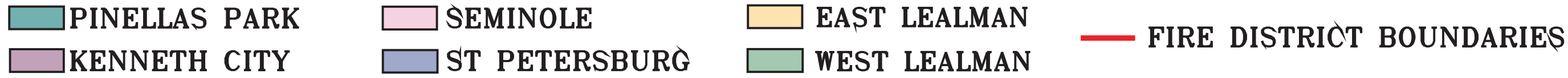
Exhibit A GREATER LEALMAN STUDY AREA MARCH 1, 2002