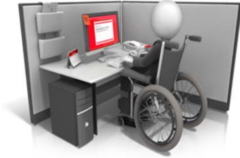
Home or Office