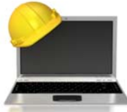
Wireless Lap Top or Tablet