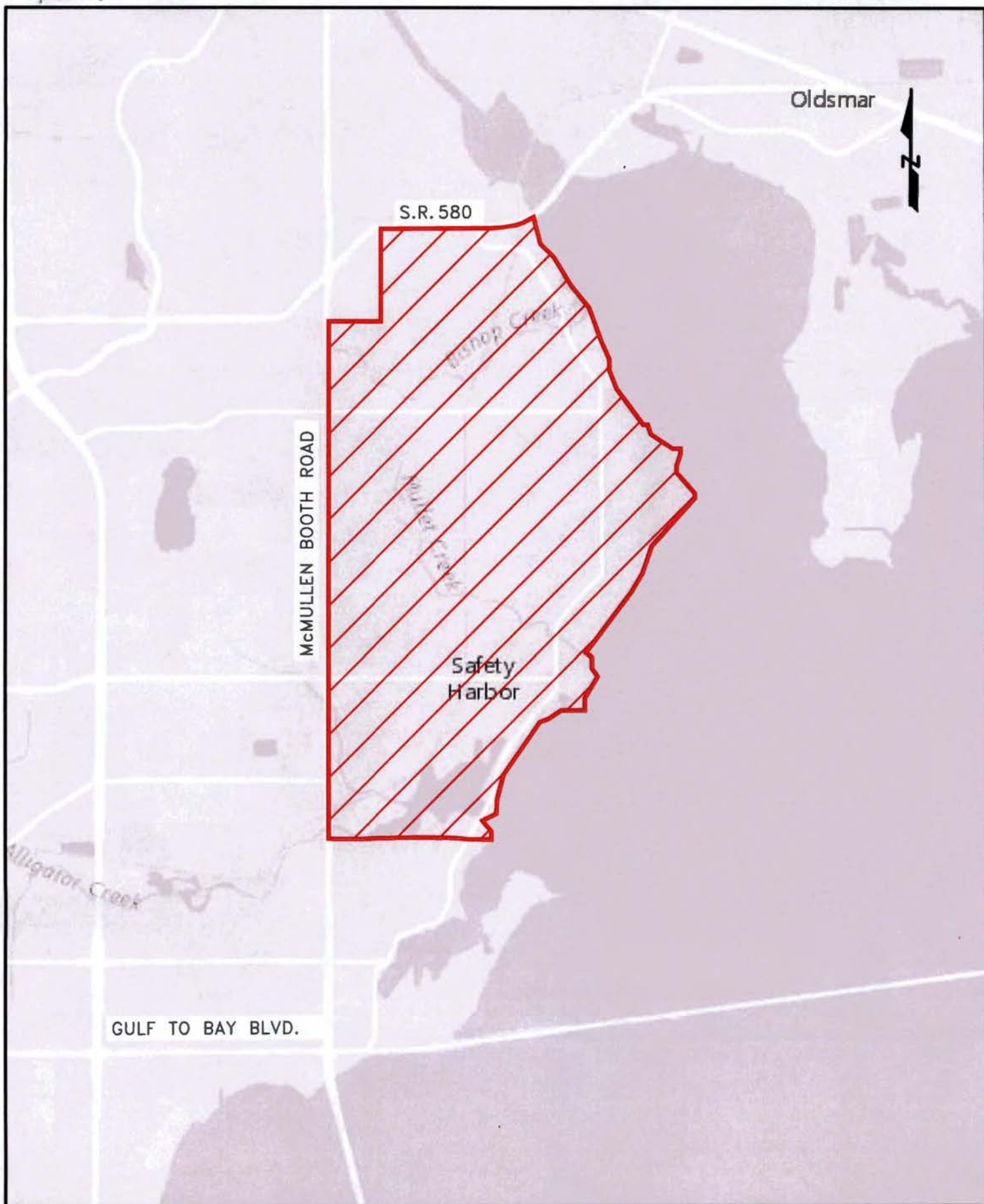
EXHIBIT "A" SERVICE AREA BOUNDARY