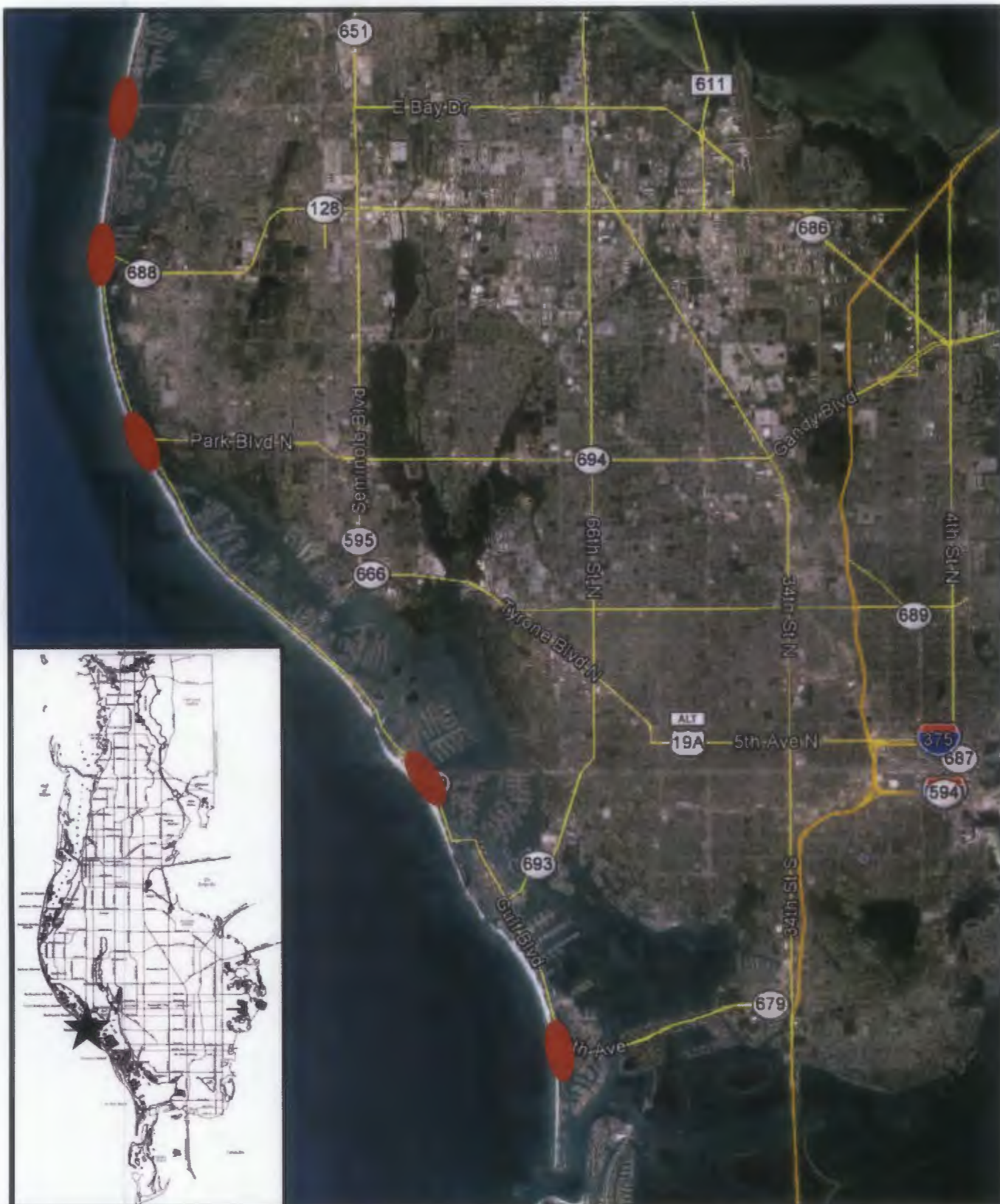
GULF BLVD ATMS – PINELLAS BAYWAY TO BELLEAIR BEACH CAUSEWAY LOCATION MAP