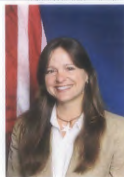
Mayor Maria Lowe

The Mayor for the City of St. Pete Beach is elected by the voters in all Districts.