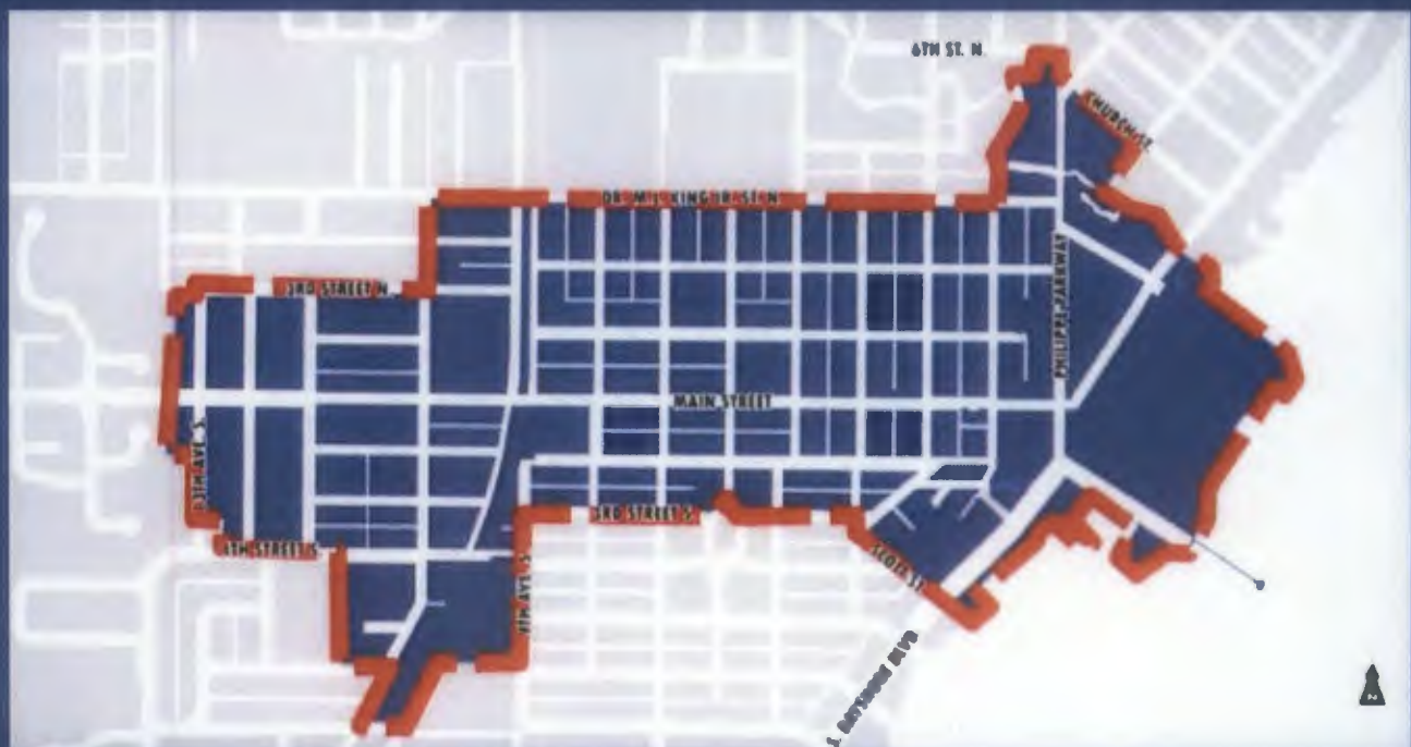
Safety Harbor Community Redevelopment Area

The CRA will continue its track record of success by building upon existing assets, proactively facilitating private sector initiatives that align with community goals, sponsoring special events and marketing the downtown as a unique destination place in the region.