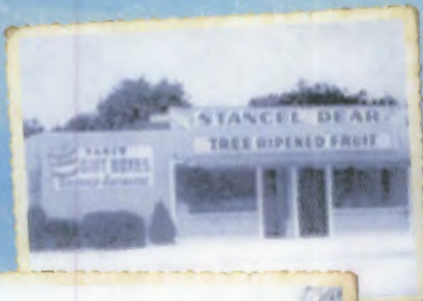
Stancel Dear Packing and Shipping at the corner of West Bay Drive and Clearwater Largo Road in the 1950s

The Community Redevelopment Districts are continuing to emerge into a live-work destination that provides new opportunities for growth in the City of Largo. Over the past fourteen years, a number of public infrastructure improvements, private building renovations and new construction has taken place in Downtown Largo and new development and investment is being planned and underway. Fiscal Year 2014 saw two major milestones for the revitalization of the Districts - the establishment of the Community Redevelopment Agency Advisory Board and the adoption and establishment of incentives for signage upgrades, quality housing development, job creation, and office development within the West Bay Drive Community Redevelopment District. The City of Largo and the CRA continue to be committed to fostering a business-friendly development process and will continue to work to attract and retain businesses, improve infrastructure and assist to streamline the City's development processes.