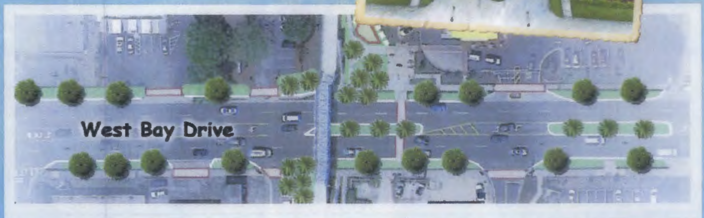
A rendering of sidewalk crossing improvements under the Community Streets Roadway and Infrastructure project.