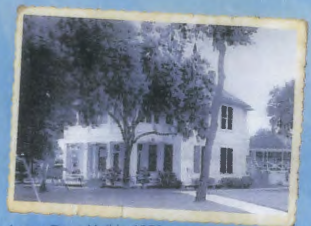
Largo Town Hall in 1950