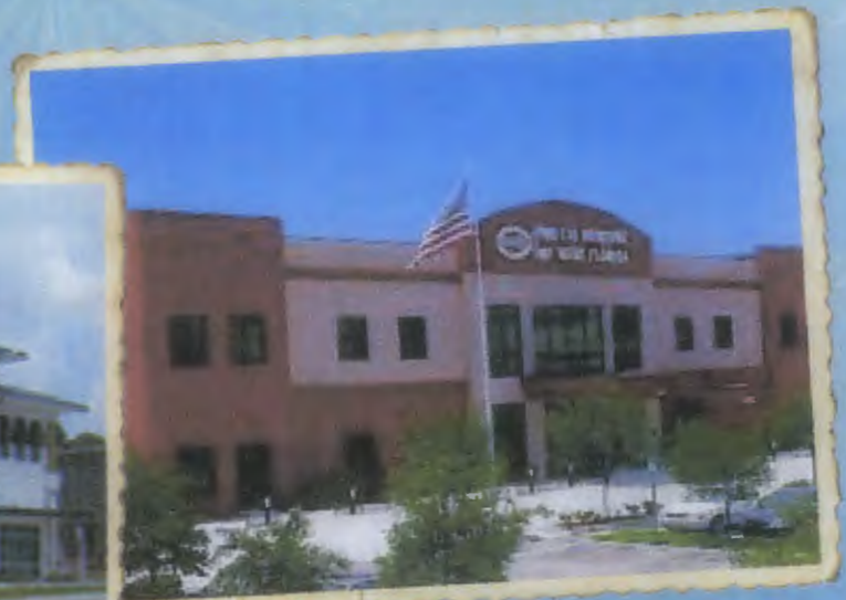
The West Florida Eye Institute, at 148 13th Street SW, will be expanding their footprint.