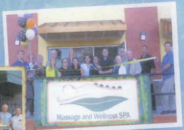
Massage and Wellness Spa is one of the new businesses that opened at West Bay Plaza in 2014