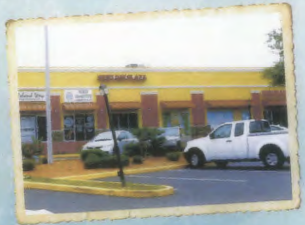
West Bay Plaza, located at 118 West Bay Drive, received a facade upgrade in Fiscal Year 2014.

During the summer of 2014, the Eye Institute of West Florida submitted plans to redevelop surface parking lots and was granted the ability to negotiate a new Development Agreement with the City for future expansion.