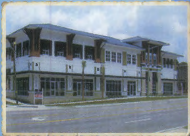
St. Michael's Eye and Laser Institute Medical Campus at 1018 West Bay Drive