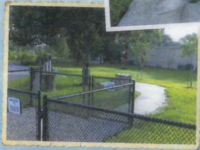
The new Dog Bone Run Dog Park and dog drinking fountain.