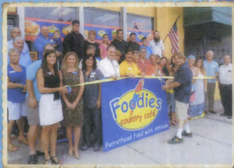
Foodie's Country Cafe restaurant opened at 118 West Bay Drive in Fiscal Year 2014