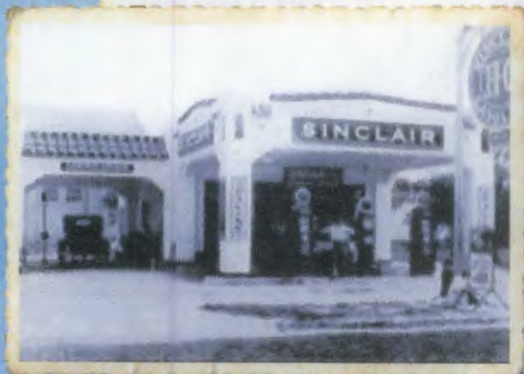
Sinclair Service Station at West Bay Drive and 4th St NW in the 1940s