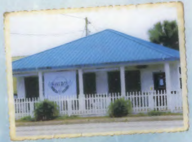
The business at 80 Clearwater-Largo Road underwent a change of ownership and was renamed West Bay Public House.