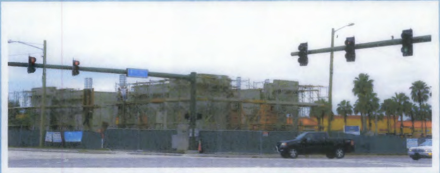
The new Chase Bank under construction located on the SW corner of Clearwater-Largo Road