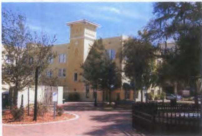
Harbor House hotel, Safety Harbor, FL - 2006 - $1.5 million - Project Architect with Gritton Architects, LLC

This new building will be constructed in the Tampa Heights historic district, encompassing 12,500s.f. of space for attorney offices with below building parking. The existing building to the west will undergo extensive renovations to add another 3000 s.f. of leasable office space.