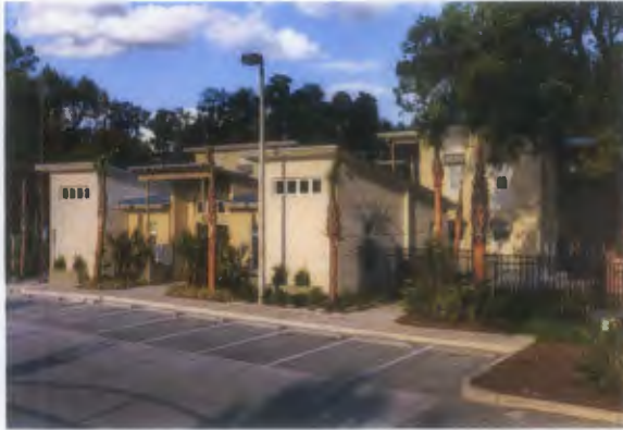
EcoOaks Apartments, Tampa, FL – 2010/2012 - $2.75 million 13000 s.f.