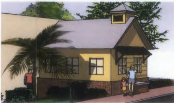
City of Dunedin – Wellhouse design - City of Dunedin, Dunedin, FL- 2009-2010, SEArchitecture LLC A prototype for the design of new wellhouses to shelter well access pumps throughout the City.