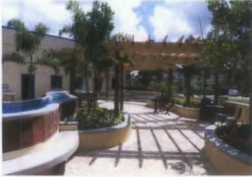
City of Dunedin Public Library, Dunedin, FL - 2009- $200K, SEArchitecture LLC Creation of a new Reading Garden including a flowing "Water Wall", a Reading Amphitheatre seating up to 30 people, new individual seating benches and walkway to the entry at the Library, individual seating areas, extensive landscaping and landscape lighting, all ADA accessible