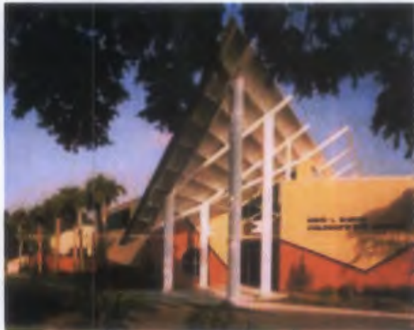
Dunedin, FL - 1999 - $1.2 million - Principal Designer/Project Mgr. with Collman/Karsky Architects

Renovations to this 1940's brick building included the addition of a new entry stair hall, creation of new office space in the existing unfinished basement area and extensive structural reinforcement . Also, comprehensive site/parking/landscaping improvements were created which resolved the difficult slope of the site.