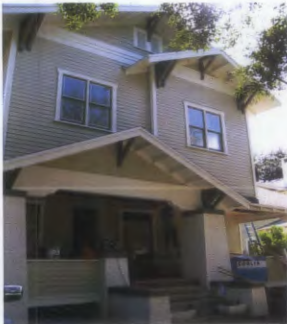
Harvill Residence, historic Hyde Park, Tampa, FL - 2007, $600K SEArchitecture LLC

This project encompassed the construction of a new 2-car garage for the owners, with artist's studio above, and covered paths tying the garage to both the home and an existing 3 car garage.