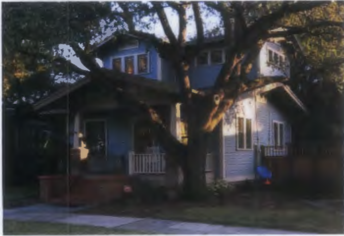
Wankelman Residence, historic Hyde Park, Tampa, FL 2006 - $600k SEArchitecture LLC

Originally intended to be an historic renovation and addition to this contributing historic home built in the 1920's in the Craftsman style, the existing structure was too badly damaged from termites and time to be preserved in its entirety. The original front and partial side walls of the house were preserved, and the remainder is new construction, resulting in a 2200 s.f. home.