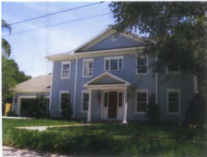
Graham Residence, Tampa FL – 2008/2009-$1.5 million, 5200 s.f., SEArchitecture LLC

This is a custom home in South Tampa for a family of 5. The homeowners requested a contemporary Colonial style home with 5 bedrooms and 3 baths. The design included a 2 story foyer with grand stair, and a large amount of custom millwork and cabinetry in both the formal living room and the family area.