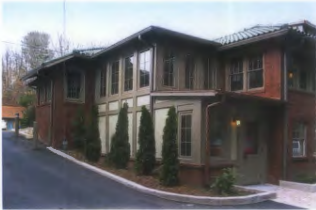
Raymond James Financial Services, Asheville, NC - $400K - 2004 - Project Architect with Samsel Architects

Renovations to this 1940's brick building included the addition of a new entry stair hall, creation of new office space in the existing unfinished basement area and extensive structural reinforcement . Also, comprehensive site/parking/landscaping improvements were created which resolved the difficult slope of the site.