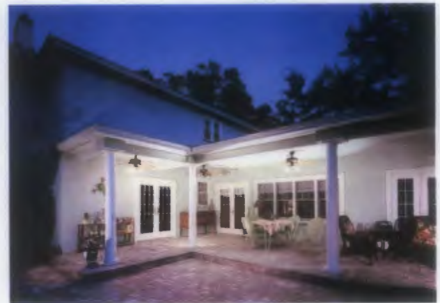
The Morrison Residence, historic Hyde Park neighborhood, Tampa, FL – 1997 $ 1 million, Susan Eftman Designs

Renovations to this historic structure in the Hyde Park neighborhood included the construction of the home's original Italiante copper clad onion dome tower, and creating custom molds for the casting of new concrete decorative tiles to replace the missing and broken clay tiles. Particular care was taken during construction to preserve the existing home's beautifully detailed corbels and window trim features.