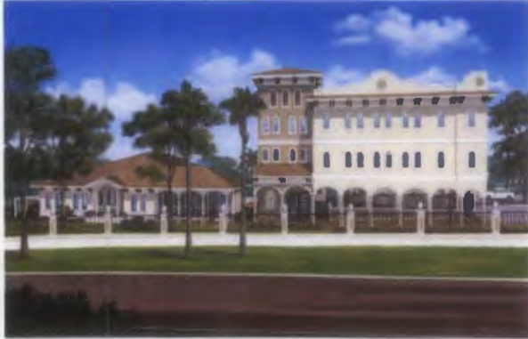
Law Offices of Schonbrun & LaSpada - Tampa, FL - constructed delayed - projected $2.5million, SEArchitecture LLC

This new building will be constructed in the Tampa Heights historic district, encompassing 12,500s.f. of space for attorney offices with below building parking. The existing building to the west will undergo extensive renovations to add another 3000 s.f. of leasable office space.