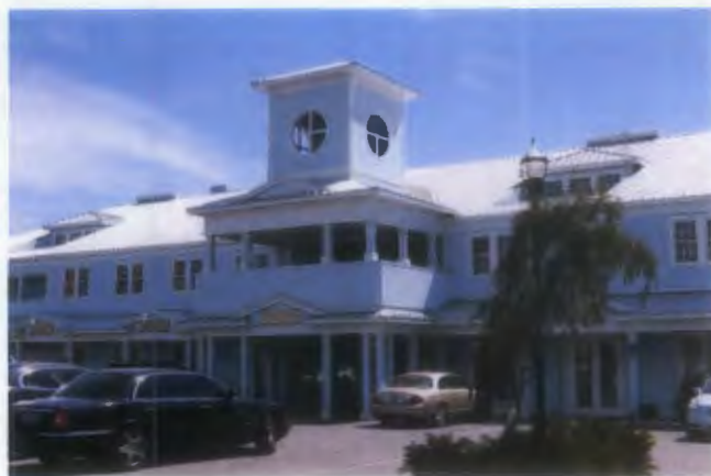
SOHO Building, Tampa, FL - 2006 - Project Architect with Gritton Architects LLC

Renovations to this historic building include the addition of a new entry tower at the rear of the building, renovating the existing fire escape stair and site improvements including a new public plaza area at the back of the building to provide a more aesthetically pleasing and easily accessible entrance to this commercial office building.