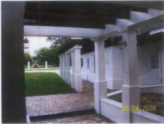
Landkammer Residence, Lutz, FL - 2007/2008, $700K SEArchitecture LLC

This project encompassed the construction of a new 2-car garage for the owners, with artist's studio above, and covered paths tying the garage to both the home and an existing 3 car garage.