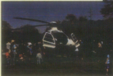
Touch -a - Truck