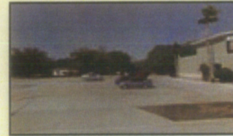
The undeveloped parking lot of St. Michael's Eye and Laser Institute Campus in 2011.

The St. Michael's Medical Campus project included the construction of 21,320 square feet of medical offices and associated parking. The medical campus features premier multi-tenant medical space with an out-patient surgery center. The owner ensured that the building was equipped to be energy efficient with impact resistant glass as well as with high quality interior finishes.