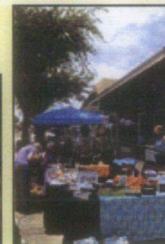
Downtown Largo Merchants Association Sidewalk Sales