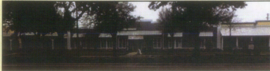
West Bay Village was purchased by new owners in FY 2013.