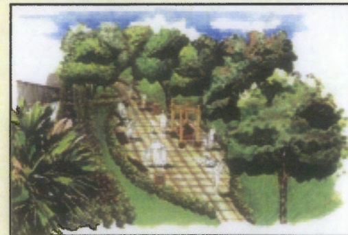
Rendering of a rest area for bicyclists and pedestrians along the portion of the Pinellas Trail located in the West Bay Drive Community Redevelopment District.

The West Bay Drive Trail Head Project is a component of the Downtown Multimodal Gateway Improvement and Capital Improvement Project and will connect the Pinellas Trail to the Downtown Largo neighborhoods and commercial center. Largo currently has over 3 miles of existing Pinellas Trail, however there are minimal access points off the trail to the community. In order to benefit from this county-wide amenity, the City and CRA are proposing to construct pedestrian and bicycle access and trail improvements along the Pinellas Trail and the WBD-CRD, which is home to a diverse group of businesses and historic neighborhoods. The project is intended to add seven (7) access points to the study area. In addition to the access, the project will provide landscaping, signage and trail amenities to areas in and around the Pinellas Trail and West Bay Drive. Largo's consultant is working with staff to evaluate the existing conditions and provide documented information necessary for the City and CRA to reach a decision on the type, design and location of a trail head, landscaping and aesthetic improvements to the Pinellas Trail. The project study area involves the Pinellas Trail and the areas adjacent to the Pinellas Trail from Washington Avenue Southwest to 4th Avenue Northwest. The cost of the study for this project is an estimated $75,000. The estimated total cost of the project is in excess of $950,000.