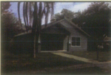
Newly constructed home at 260 5th St NW.

In 2008, the Largo Housing Division purchased a dilapidated house that was in foreclosure through a short sale. The house was demolished with the intention of building a new affordable house on the property. The downturn in the economy made the new construction of a house unfeasible. In 2012, Largo entered into a partnership with Pinellas County to building affordable housing