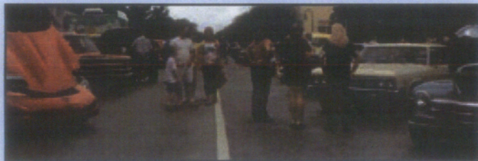
The Rotary Cruising the Park Car Show held in June 2013.