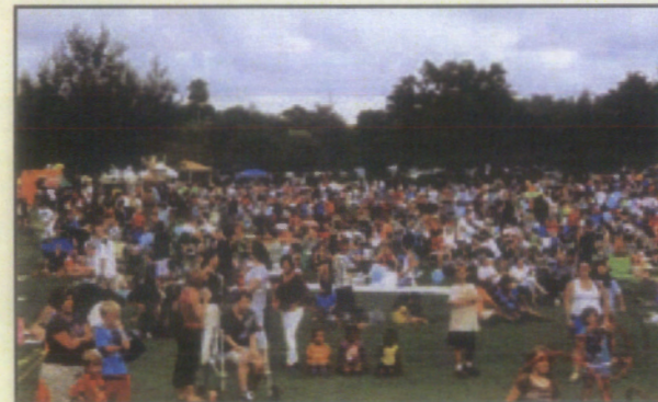
Citizens gather for the 4th of July Celebration.