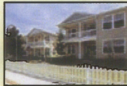
West Bay Village homes and retail at West Bay Drive and 1st Ave respectively, in 2013.