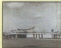
Diagnostic Clinic, 1551 West Bay Drive in 1972.

Eye Center, West Bay Village, and the Largo Bayhead Action Park that features ponds that serve as the master stormwater system for the WBD-CRD. The CRA, along with the City of Largo, has made a commitment to foster a business-friendly development process and is working towards creating innovative incentive programs for attracting private development. The City and CRA will continue to work aggressively developing incentives that can attract and retain businesses, improve infrastructure and assist to streamline processes for private improvements and development.