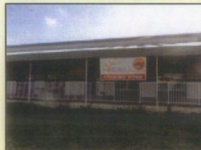
Proino Breakfast Club opened in the spring of 2013 at 201 West Bay Drive.