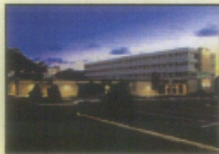
West Bay Professional Plaza, 1551 West Bay Drive, in 2013.