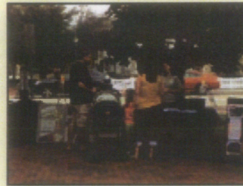
National Night Out was held at Ulmer Park on October 2nd, 2012. The free event is sponsored by the Target Corporation and local law enforcement and is hosted nation-wide every year to promote awareness, support and participation in anti-crime efforts.