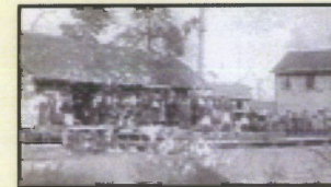
The Orange Belt Line Railroad Station, circa 1900.