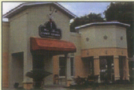
West Florida Dance Center, a dance and fitness academy opened at 251 West Bay Drive.