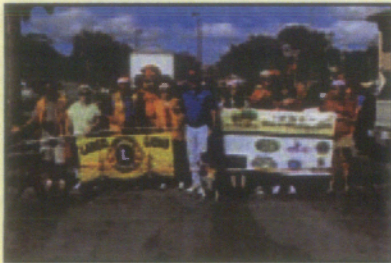
The Second Annual "An Old Fashioned Christmas Parade" held in December 2012 presented by the Old Northwest business organization, various merchants and non-profits from the Largo community.