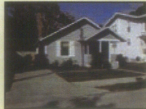
The home at 159th 5th Street NW before and after improvements made by the City of Largo.

to the home beginning in June 2013. Exterior repairs to the home included new sidewalks, new shingles, chimney repair, tree removal, new paint, new windows, and a new HVAC system. The interior improvements to the home consisted of new insulation, a new bathroom, existing bathroom remodel, new gas heater, demolition of a wall, new drywall, and new flooring. Clearwater Gas provided new service to this house so that the new appliances could be energy efficient and fueled by natural gas. The home, now weatherproofed, renovated, and more energy efficient, is expected to close escrow in February 2014 for $98,000. Largo down payment assistance will be provided to the buyer.