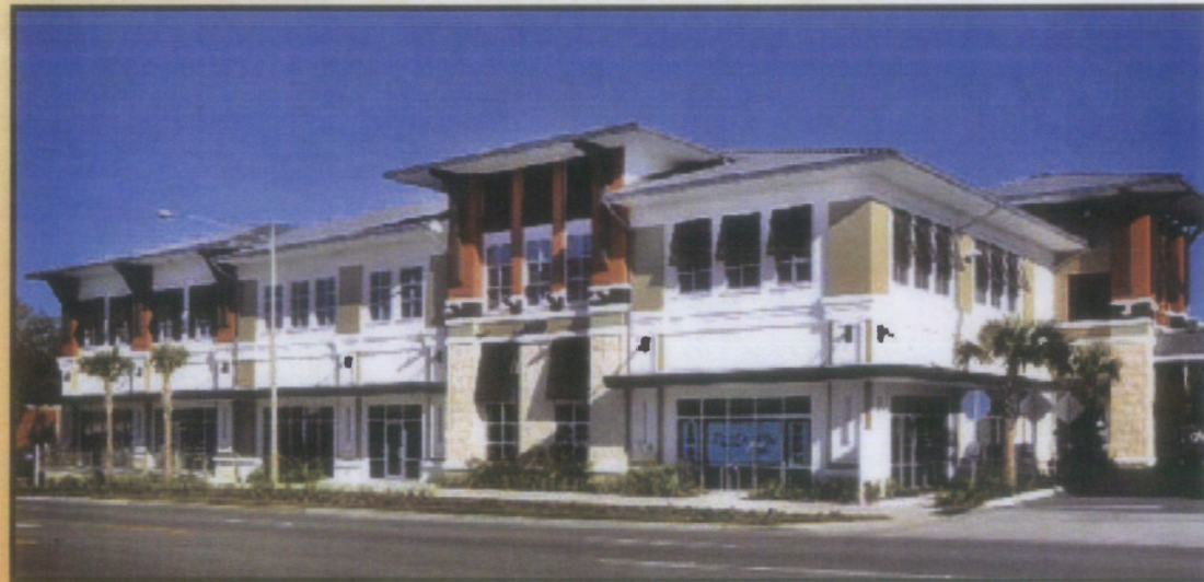
St. Michael's Eye and Laser Institute