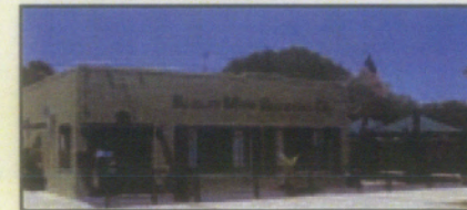
Barley Mow Brewing Co., 2013 at the northeast corner of 6th Street and West Bay Drive.