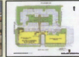
St. Michael's Eye and Laser Institute Campus site plan in 2013.