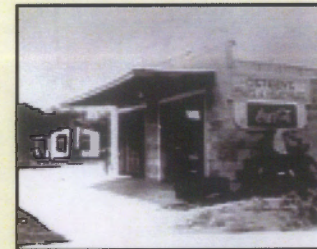
Osteen's Store, at the northeast corner of 6th Street and West Bay Drive in 1946.