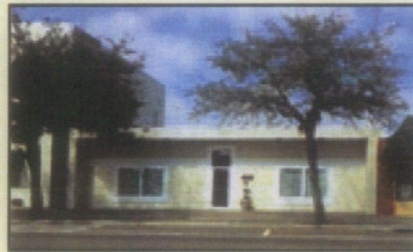
Munce Marketing Group opened at 200 West Bay Drive in the Fall of 2013.