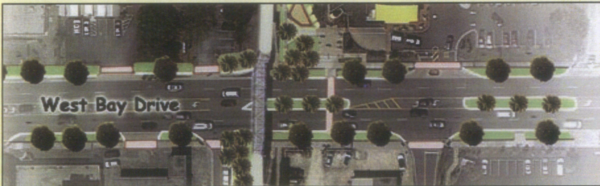
An aerial of proposed Downtown Multimodal Gateway Improvements, including multimodal streetscape enhancements and midblock improvements.

This project will address two (2) segments of West Bay Drive and will make critical repairs and rehabilitation of existing roadway pavement, sidewalks, and curb ramps. The first segment of the project will improve West Bay Drive between 20th Street and Clearwater-Largo Road and will include a gateway monument at the Pinellas Trail crossing with a trail head and wayfinding signs, landscaping, roadway retrofit and bike facilities. The second segment of the project will span from Clearwater-Largo Road to Missouri Avenue and will feature a gateway monument and plaza improvements to the triangular parcel at the Southwest corner of West Bay Drive and Missouri Avenue, a roadway retrofit with bike facilities, mid-block intersection improvements and pedestrian safety modifications. The multimodal gateway improvement costs will take place over several years and a budget of $1,670,000 has been identified for all of the updates and amenities. A total of $1.175 million will be invested in the WBD-CRD from the total budgeted amount.