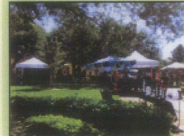
Second Saturday Market