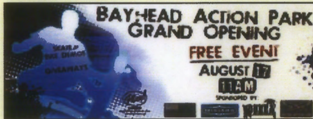
Grand Opening of the Bayhead Action Park took place on August 17, 2013 and hundreds of skaters and bikers attended to try out the new facility.

This park is directly adjacent to the WBD-CRD's master stormwater ponds, which were redone with landscaping, walking trails and new pumps in FY 2012 with tax increment funds.