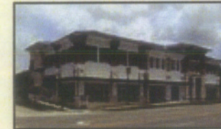
The newly constructed St. Michael's Eye and Laser Institute Campus in 2013.