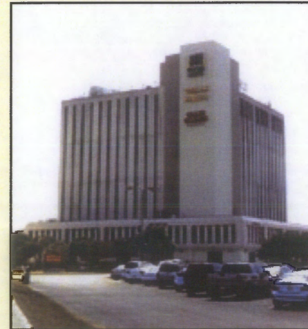
801 West Bay Drive was purchased by new owners in 2013.