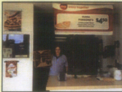
Mama Faraone's Pizza, hand made Chicago Style Pizza restaurant at 1280 West Bay Drive, opened in December 2012.