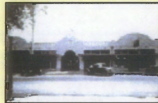
Ulmer Arcade, 1st Ave in 1920.

City services. The City outgrew its rail station, City Hall and library and the Downtown was transformed into an urban activity center. The Florida Department of Transportation widened West Bay Drive in 1982 and new roadways and buildings replaced the original City Hall and library.