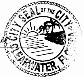
Rosemarie Call City Clerk

RECEIVED BOARD OF 2013 SEP -4 PM 1:18 BOARD OF COUNTY COMMISSIONERS PINELLAS COUNTY FLORIDA