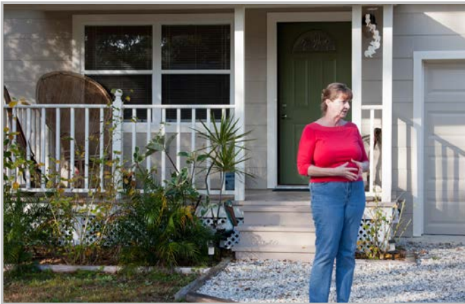
First-time homebuyer on ABC Action News