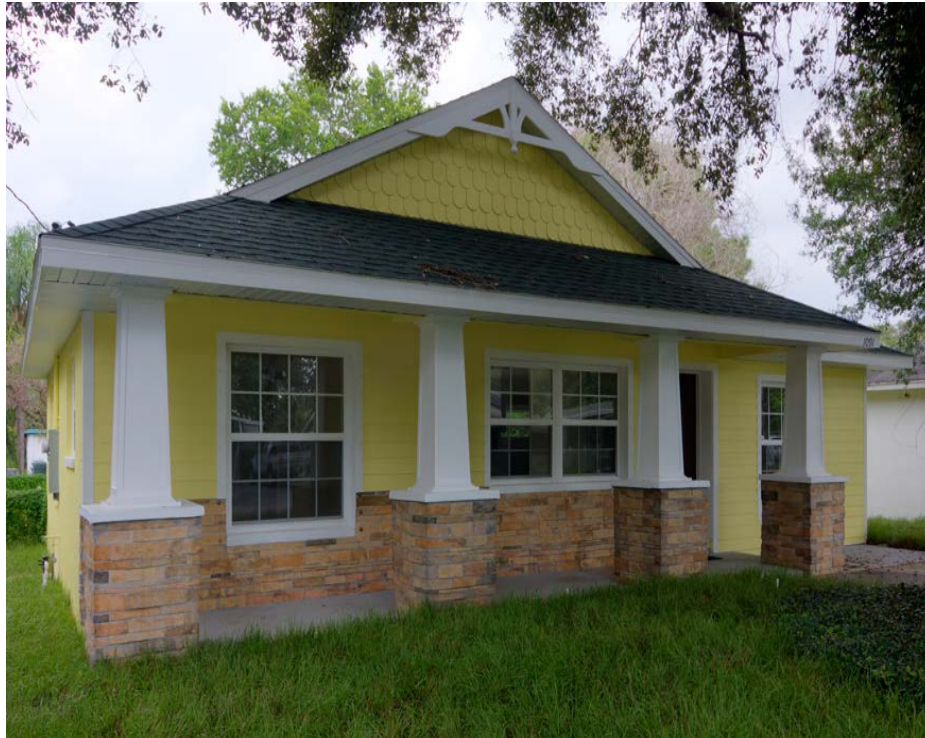
Renovated Proud Ground Pinellas Home