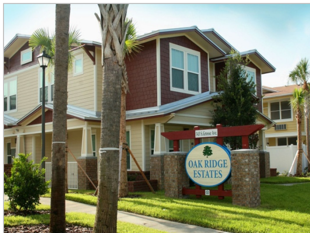
Oak Ridge Estates