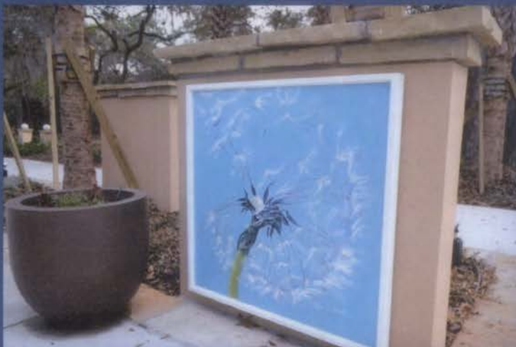
Example of public art which is displayed throughout the Park