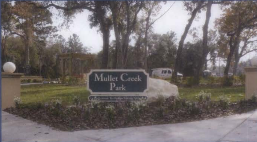
View of Mullet Creek Park which forms the northern gateway to Downtown