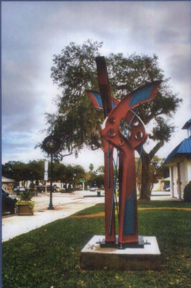
Public Art Installation in front of City Hall