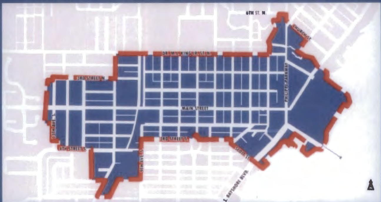
Safety Harbor Community Redevelopment Area

The CRA will continue its track record of success by building upon existing assets, proactively facilitating private sector initiatives that align with community goals, sponsoring special events and marketing the downtown as a unique destination place in the region.