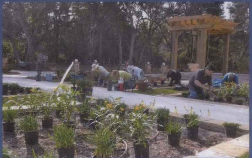
Community volunteers planting Demonstration Garden