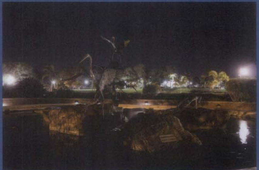
New Lighting at Marina Park