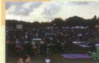
4th of July Celebration

In November of 2011, the West Bay Drive Community Redevelopment District was home to Pinellas County's first Food Truck Rally.