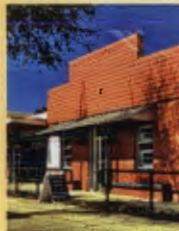
Xtra Medium Productions 214 West Bay Drive