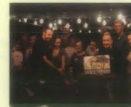
Barley Mow, 518 West Bay Drive

Barley Mow Brewing Company moved into Downtown Largo and opened for business in 2012 in the City-owned building in the 500 block of West Bay Drive. The craft brewery improved the facade of the building and attracted a new nighttime population to the West Bay Drive Redevelopment District. As a result of the exterior improvements and goodwill the tavern created in the community, the company was awarded a Community Champion award by the City of Largo.