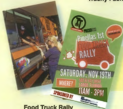
Food Truck Rally

In November of 2011, the West Bay Drive Community Redevelopment District was home to Pinellas County's first Food Truck Rally.