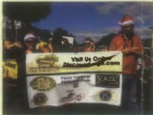
An Old Fashioned Christmas Parade

West Bay Drive Community Redevelopment District is home to Largo Central Park , a 70-acre complex consisting of parks, walking trails, a miniature train, the Cultural Center, Feed Store and the 90,000 square-foot Largo Library. The park is a central hub for entertainment in Largo and produces a variety of indoor and outdoor events throughout the year.