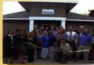
Main Street Chiropractic and Massage 520 1st Ave SW