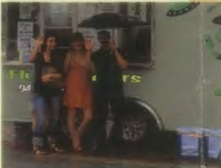
Abilities Wine Festival and Food Truck Tasting