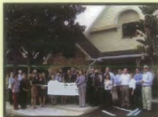
Christian International School of Healthcare Professions 300 East Bay Drive

The West Bay Drive Redevelopment District is now home to a 37,000 square foot nursing school campus. Christian International offers registered and practical nursing programs and boasts a skills lab equipped with life-size patient simulators where students learn the basics to advanced nursing care.