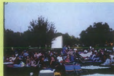
Movies in the Park