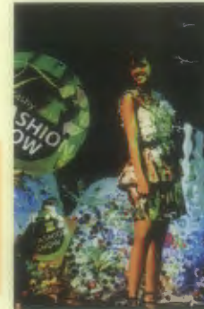
Trashy Fashion Show