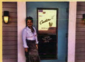
Couture'd New and Resale Boutique 910 West Bay Drive