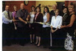
Sound Advice Hearing Solutions 861 West Bay Drive