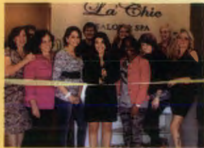
La Chic Salon and Spa 301 West Bay Drive