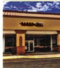
Sage's West Bay Bistro 883 West Bay Drive