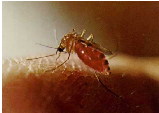
Figure 3. Adult female Florida SLE mosquito, Culex (Culex) nigripalpus Theobald, with blood meal.

Gravid Culex nigripalpus females take flight during evening crepuscular periods and search throughout the night for oviposition sites. Eggs of this species have been reported in virtually every type of aquatic habitat. However, the species is best described as a flood water Culex . Females prefer to lay eggs in freshly flooded roadside ditches and agricultural furrows, habitats that flood infrequently