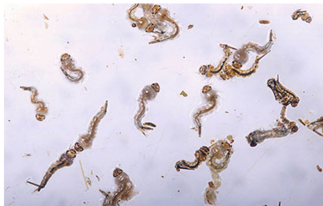
Figure 4. Larvae of Culex (Culex) nigripalpus Theobald.

Larvae develop in the rich organic mixture found in shallow flooded ditches. Larval development time is temperature dependent, and is most rapid in mid-summer when the water temperature in the ditches may exceed 100 degrees F. Larvae develop through four instars, each lasting approximately 24 hours in summer and 48 hours in winter. Fourth instar larvae molt to form pupae from which the adult mosquito emerges 36 to 48 hours later.