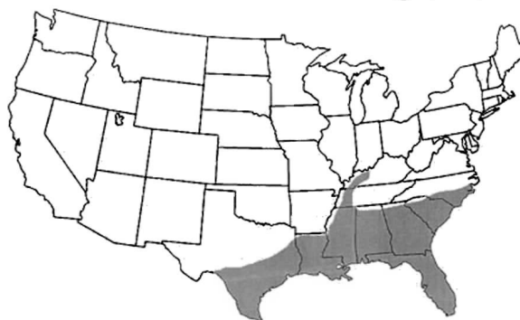
Figure 1. U.S. distribution of Culex nigripalpus . Credits: Carpenter and LaCasse, 1955 edition of Mosquitoes of North America