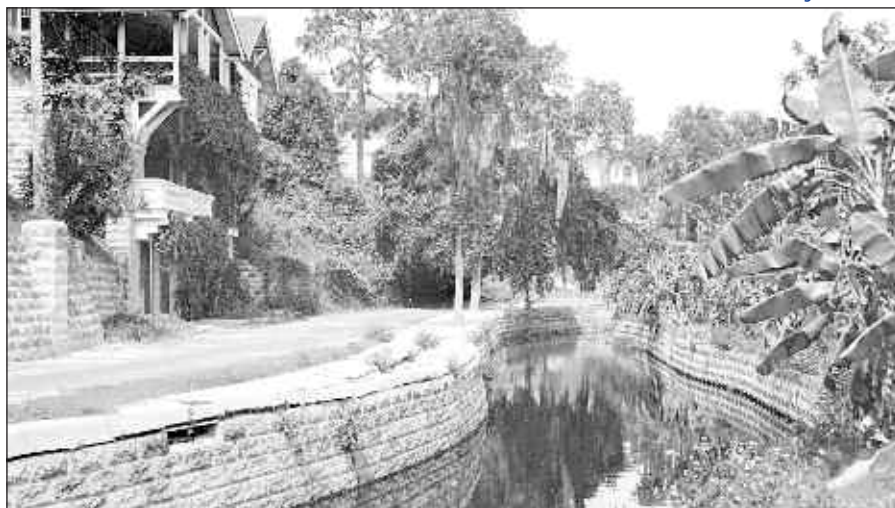
Roser Park, St. Petersburg, mid-1920s.