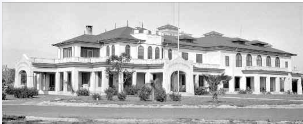
St. Petersburg Yacht Club, mid-1920s

Incorporated in November 1970, Seminole is Pinellas County's newest city. This book travels beyond municipal boundaries and examines the entire region. Royalties for Seminole will benefit both PCHS and the Seminole Historical Society.