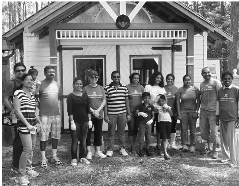
Members of Tata Consultancy and their families strike a pose in front of the Heritage Village firehouse after a day of volunteering.

Tata Consultancy Services Limited (TCS) is the largest India based IT services company. At TCS, sustainability is seen as a state of being in balance between Corporate Economic Responsibility and Corporate Social Responsibility.