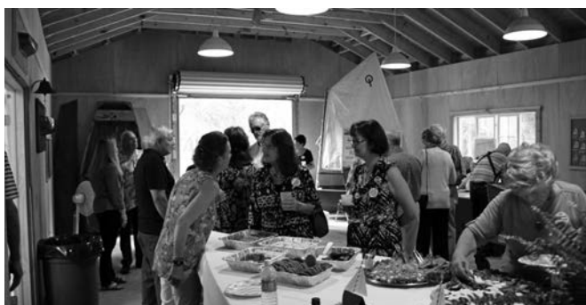
Guests enjoy activities at the McKay Creek Boat Shop donor reception on April 25, 2015

We will be having the official ribbon cutting ceremony during the annual Country Jubilee on October 24. Thanks to the hard work of our volunteers and the generosity of our donors, the