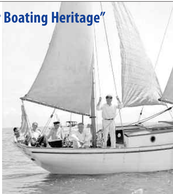
"Enjoying the waters along Pinellas County in the mid-1920s."

As you visit Heritage Village, you will notice a new structure taking shape along the eastern side of the campus, near the Greenwood House and McKay Creek. With the support of the Pinellas County Historical Society and other partners—including the Clearwater Yacht Club—a replica of a boat shop has been designed to celebrate the importance of coastal living and recognize the practical and recreational nature of boating in our county's history.