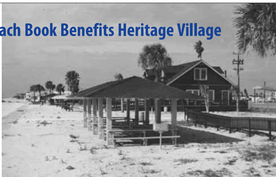
A view of Archibald Park as it appeared more than forty years ago