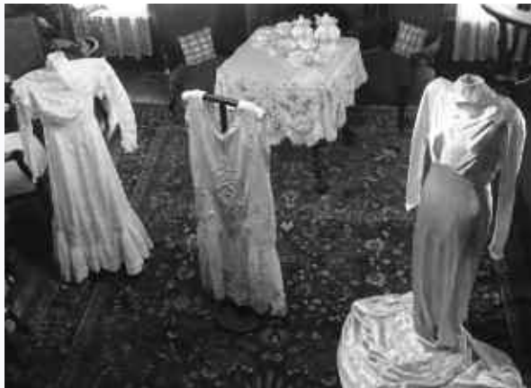
Vintage wedding gowns from the Heritage Village collection are exhibited in the formal parlor at the House of 7-Gables