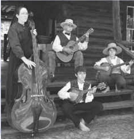
2014 Pinellas Folk Festival Performers – “The Shut Yer Trapp Family Band”