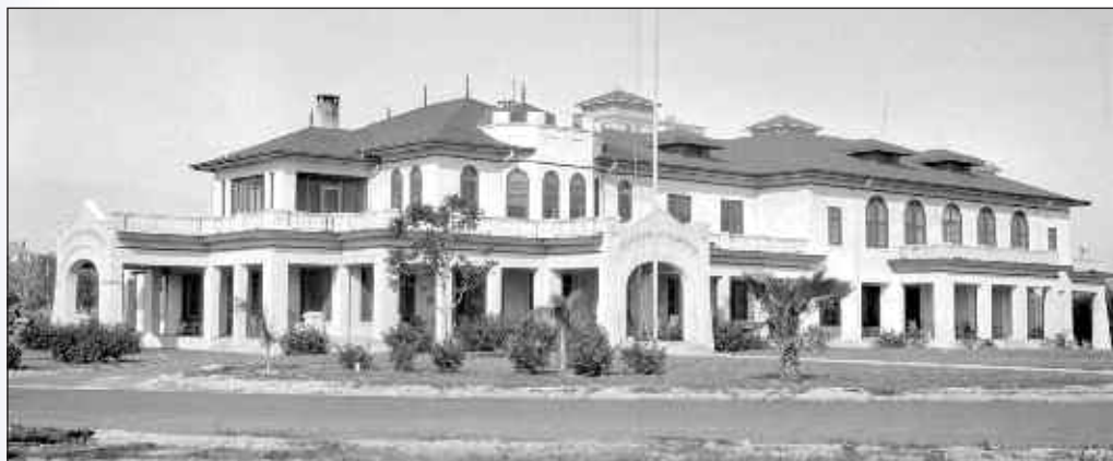
St. Petersburg Yacht Club, mid-1920s

Incorporated in November 1970, Seminole is Pinellas County's newest city. This book travels beyond municipal boundaries and examines the entire region. Royalties for Seminole will benefit both PCHS and the Seminole Historical Society.